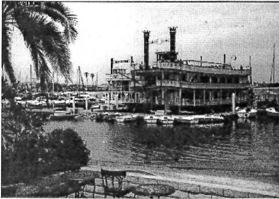
The William D. Evans (foreground) and Bahia Belle (back)