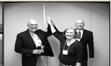
The Twain forces celebrate their victory.

Photos and captions courtesy of Jim Leonard